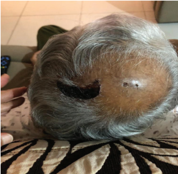
Figure 2: Wound immediately after removing sutures on 28/8/21.