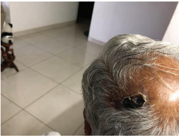
Figure 3: Wound as on 22 October 2021.