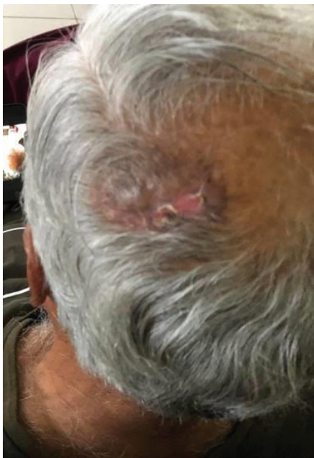
Figure 4: The wound as on 20 November 2021, 3 months after the injury.