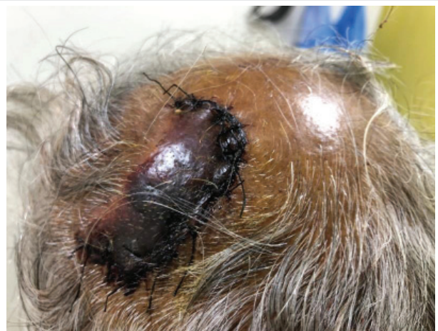
Figure 1: Wound immediately after suturing 19/8/21.

Fortunately, none of the Immediate Symptoms of inability to remember the cause of the injury or events that occurred immediately before or up to gaining consciousness, confusion, and disorientation., headache. Dizziness, blurred vision, nausea or vomiting and ringing in the ears did not exhibit in my case.